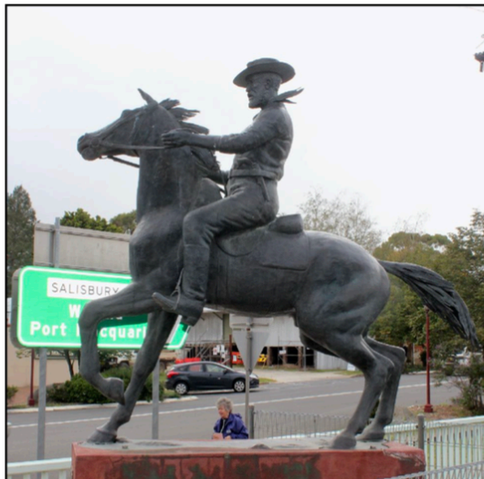
URALLA Thunderbolt & horse statue (and Yenda Holland)

This was followed by a visit to Thunderbolt's Rock, and then to the cemetery where the beloved scoundrel has pride of place near the entrance gate.