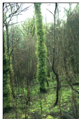
Hillsdale-Dorrigo Bushfire recovery

Up to this time, on the train and elsewhere, all had been lush green, with not a sign of the recent catastrophic bushfires. But on the run to Dorrigo the burnt-out bush was unmistakable, the blackened deva-