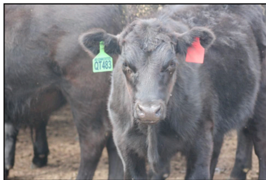
GUYRA Box Hills Station. One of its steers, with ear tags. These steers are bought at about 250kg in weight each, and fattened up over a year or more to over double their initial weight, before being on-sold. The weight gain is around 0.8kg a day.