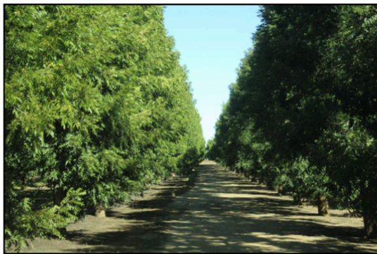
MOREE 35km east: Trawalla Pecan farm Tree row

Wednesday , the final day, featured a visit to a pecan farm: something easier stated than comprehended. Pecan nuts grow on trees, and there might have been 95 000 of them at Trawalla (meaning flood waters in the local Kamilaroi language). This establishment, set in a bend of the Gwydir River 35km east of Moree, had what seemed to be about 1000 endless rows of pecan trees. These were all 15m high and set precisely 10m apart, their branches often meeting across the dividing strips, combining to make a massive orchard of greenery of overwhelming proportions. There is probably no bigger pecan project anywhere.